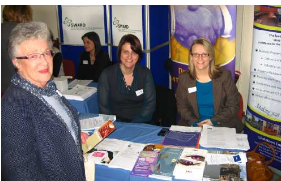
One of the many information stands at the 'Beating the Drum' Event in Loughry

Speakers also included rural women who have established local businesses, Invest NI and Rural Network for Northern Ireland. The event included Information stands from Department of Agricultural and Rural Development (DARD), the 7 LAGS, Invest NI, Ulster Community Investment Trust, as well as a number of others. Feedback from the participants was very positive. On leaving the event one rural woman commented: "This is exactly the type of event we need as rural women. I have had a business idea for using some of our old farm buildings for a lifetime and up until today I really had no idea that there was so much support out there. I really feel very excited by the prospect of delving deeper into the Rural Development Programme to see exactly how I can benefit from this funding and in turn benefit my family by generating a little more income to the household."