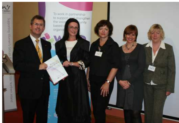
Minister Jeffrey Donaldson with the WCRP partners at the launch of the report

time it gives us an impression of the experiences of women in Northern Ireland during the last four decades and clearly illustrates that for many, it didn't really matter where you lived - worry, fear and anxiety - were the emotions experienced by all."