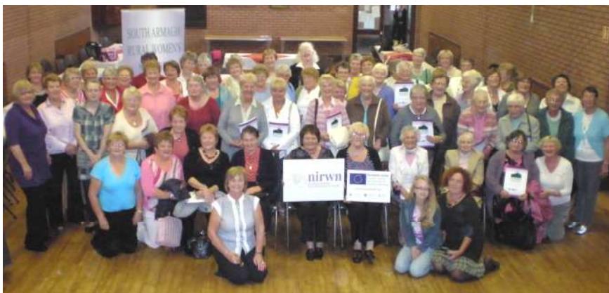
Ladies from South Armagh and Antrim who thoroughly enjoyed the entertainment in Crossmaglen Community Centre

The sun shone warmly over Crossmaglen Community Centre on Thursday 24th September, when over seventy women came together to celebrate their cultural diversity. The ladies came from the wider South Armagh area, including Forkhill, Markethill and Tandagree, North Louth including Faughart and Kilcurry and Larne in North Antrim. The event was jointly organised by South Armagh Rural Women's Network's Behind the Masks Programme and Northern Ireland Rural Women's Network.